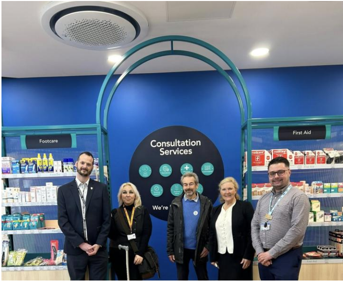
What does a health hub look like? Co-op in Birchwood