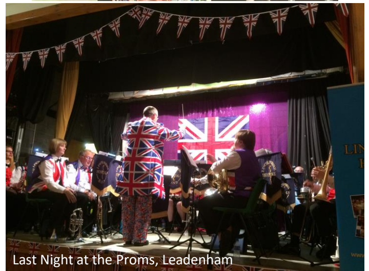
Last Night at the Proms, Leadenham